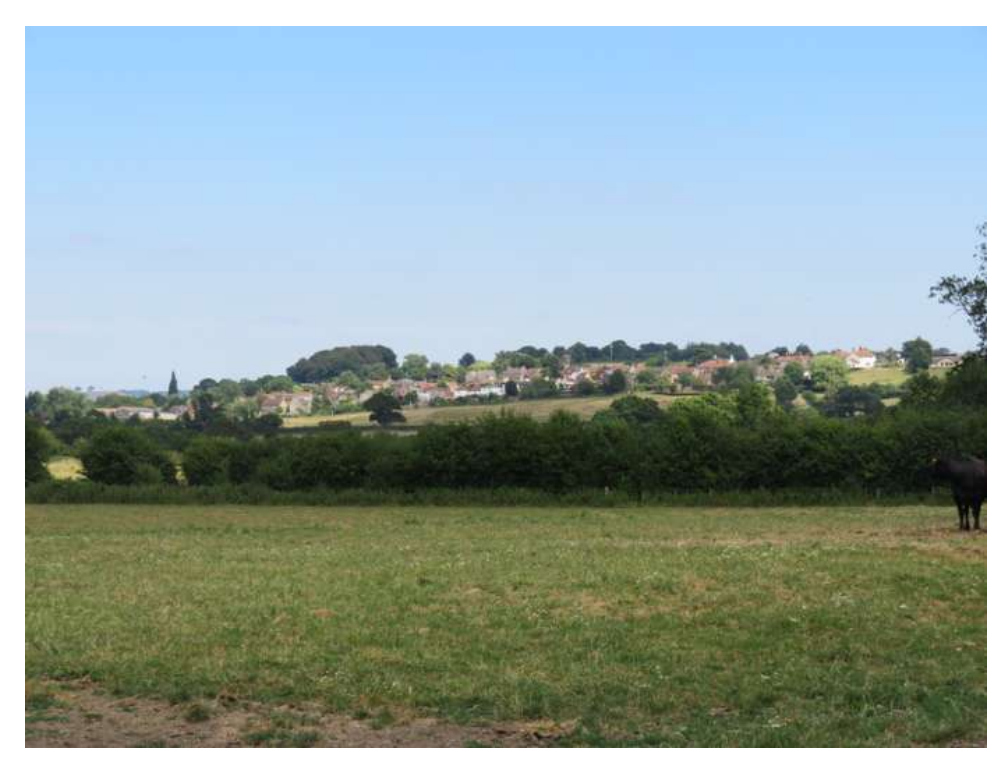
View 36 – Row Lane from the south Grid ref: ST918605

View from the corner of the lane to Seend Park Farm on the junction with Bridleway SEMI30 and footpath SEMI36, looking south east towards the north east ridge of Row Lane.