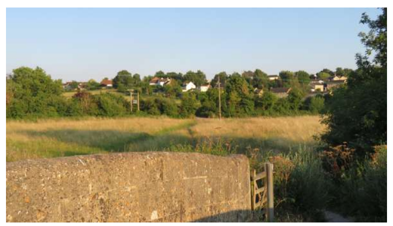
View 24 – Seend Cleeve from near the Barge Inn Grid ref: ST931614

View of Seend Cleeve from the K & A Canal on the stone bridge along footpath (SEEN52) by The Barge Inn looking south.