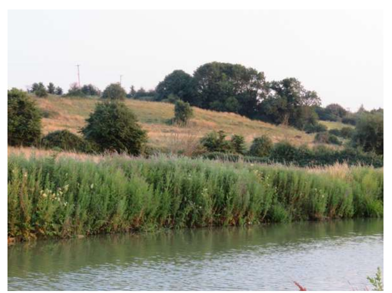
View 26 – Seend ridge from K&A canal towpath in Sells Green Grid ref: ST949618

View from the moorings just to the west of Spout Lane bridge looking to the North ridge of Seend Village. Again the land slopes steeply upwards from the canal side.