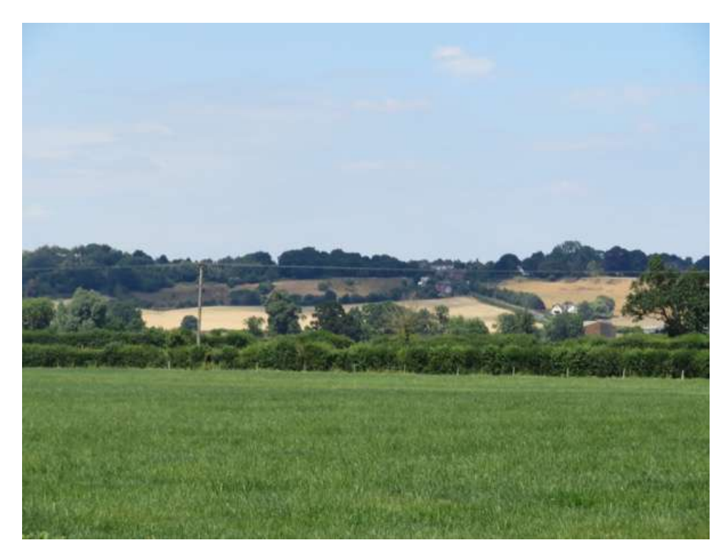
View 33 – South of Seend ridge at the C20 turn off to Bulkington Grid ref: ST949592

At junction of C20 turn off to Bulkington.