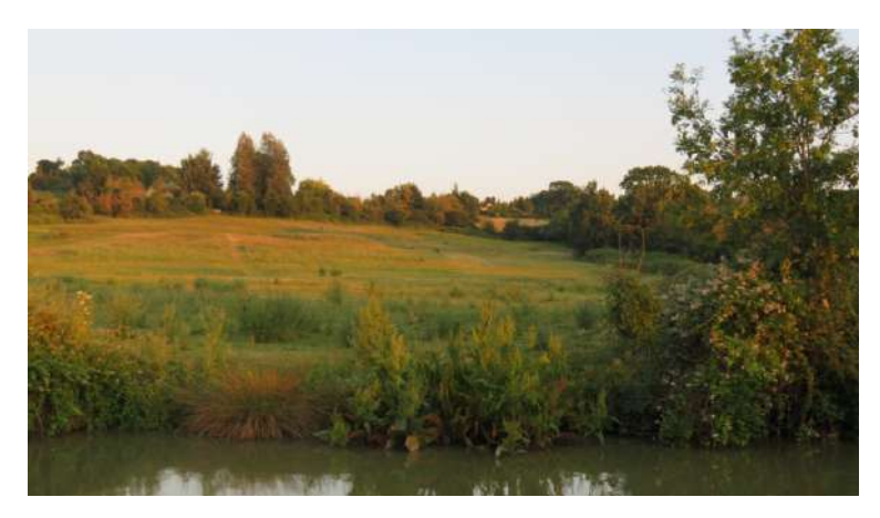
View 25 – Seend ridge from the K&A canal near Lock Cottage Grid ref: ST938615

View towards Seend Village ridge from the K & A Canal by Lock Cottage looking south.