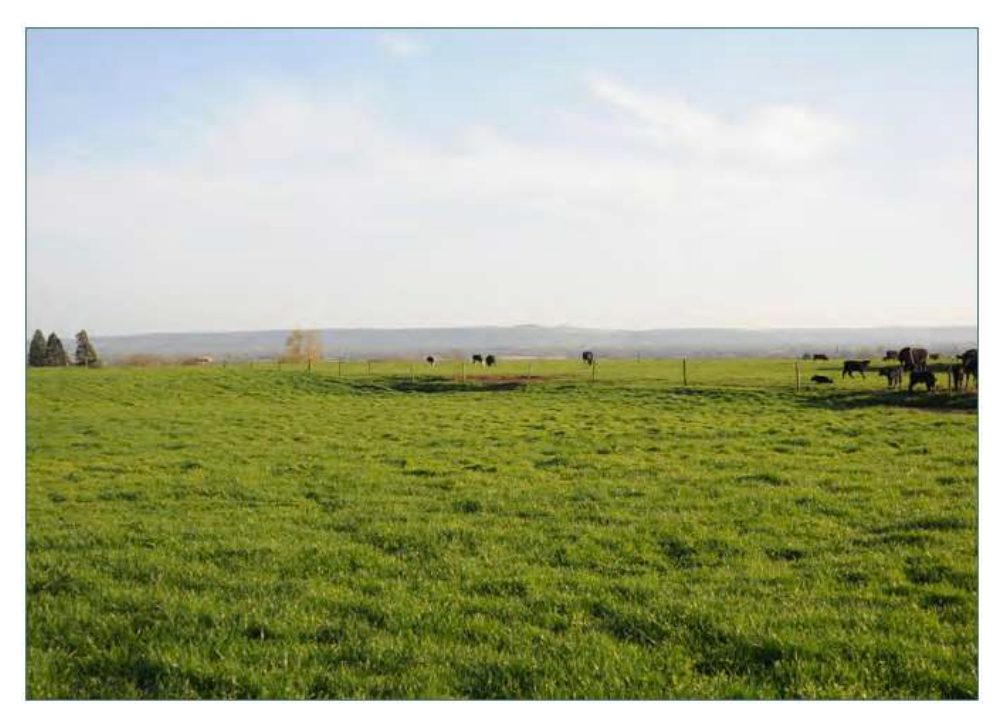
View 2 – View towards Salisbury Plain from Seend Cleeve Grid ref: ST932608

View looking south from footpath (SEEN23) south of Seend Cleeve towards Salisbury Plain. Representative of views towards Salisbury Plain from the south of settlements in the Parish.