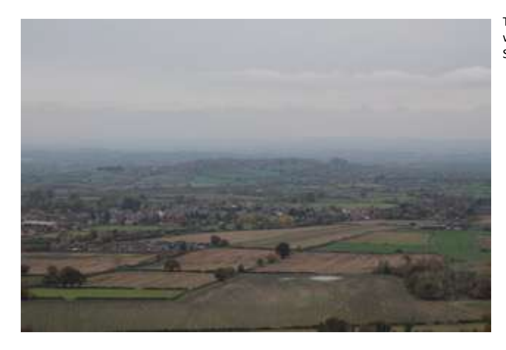
View 31 – Seend Parish from Roundway Hill Grid ref: SU004638

Taken from Roundway Hill at the edge of the woodland looking west / southwest. You can see Seend Fork junction and Rowde in the middle distance. Salisbury Plain can be seen in the far distance beyond the ridge of Seend Village.