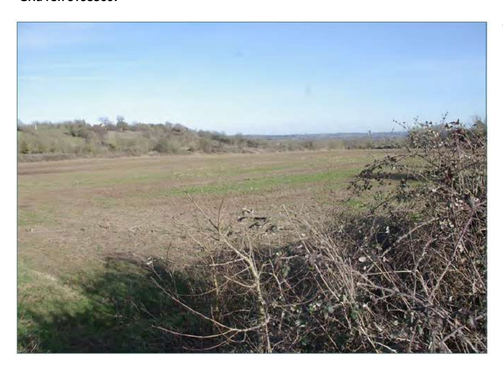
View 3 - View looking south-east from the footpath (SEEN12) south of Seend Cleeve towards Salisbury Plain Grid ref: ST933607

The steep slopes in the mid distance form part of the landscape gap between Seend Cleeve and the cluster of properties south of Pelch Lane between Seend and Seend Cleeve. The character of this view is exclusively pastoral.