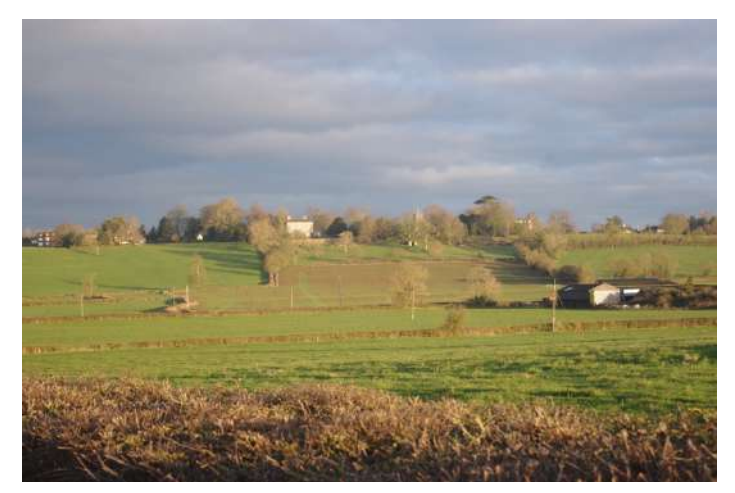
View 19 – Seend ridge from the south Grid ref: ST945598

View from the C20 by Seend Bridge House, looking north towards the south ridge of Seend Village.