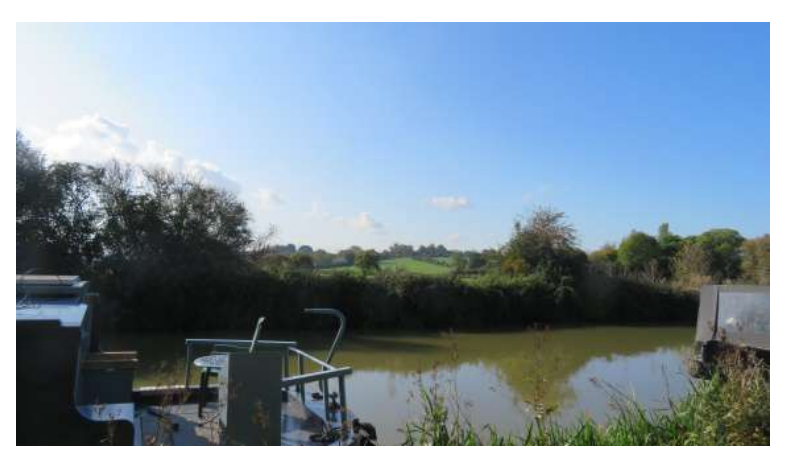
View 28 – Seend ridge from near Parish Boundary at Martinslade Grid ref: ST958617

View of Seend ridge from the eastern end of our canal section between Martinslade & Foxhangers. Photo taken just inside the Parish boundary.