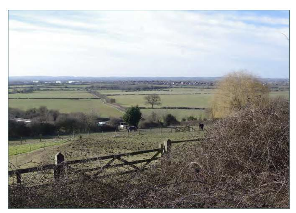
View 1 - View looking north-west towards the Kennet & Avon Canal and Melksham beyond from The Stocks lane. Taken from footpath (SEEN38) Grid ref: ST929606

The key characteristics of this view are the sloping fields with boundaries marked by vegetation, containing individual buildings, in contrast to the flat agricultural valley landscape beyond and the settled area of Melksham beyond that. PRoW SEEN13 runs alongside the left of the hedgerow running diagonally in the centre of the frame shown opposite. The PRoW follows this hedgeline towards the canal swingbridge & Bowerhill. The movement of walkers and horse-riders is often seen in the landscape.