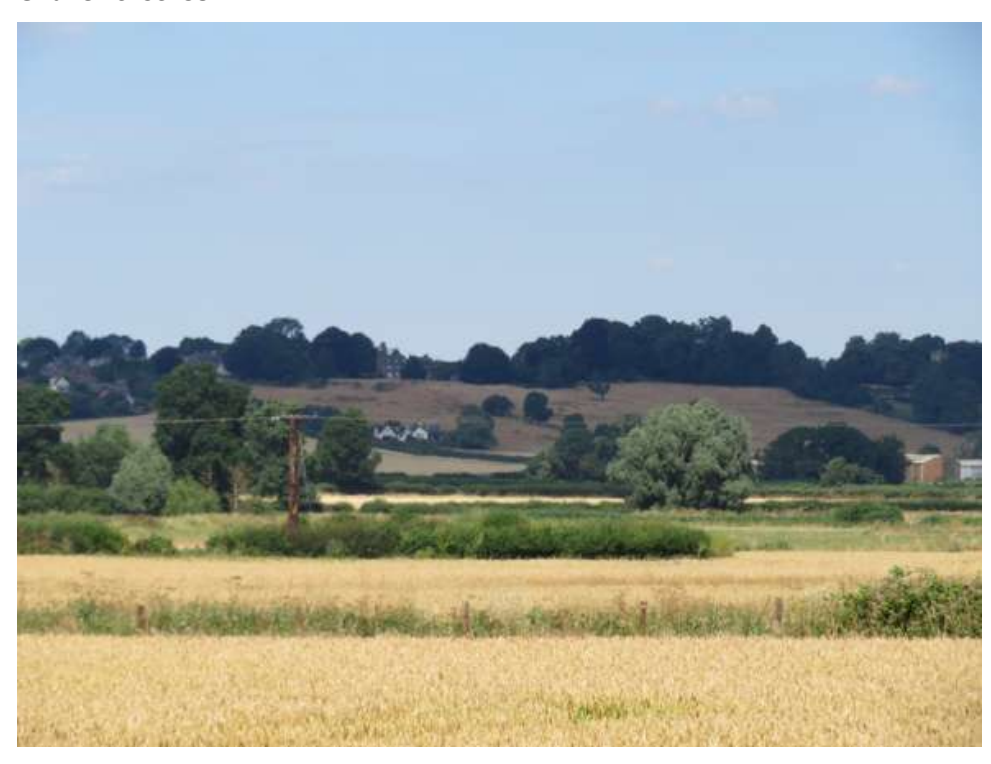
View 34 – Seend ridge from Pantry Bridge Grid ref: ST937587