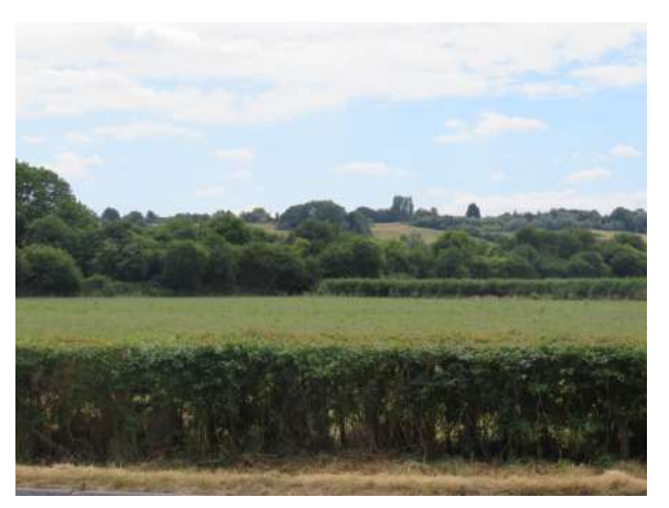
View 18 – Seend ridge from A365 junction with Broad Lane Corner Grid ref: ST948624

View from the A365 junction with Broad Lane Corner, looking S/W towards the North ridge of Seend. The photo is taken from the junction at Broad Lane corner. This is the meeting point of several bridleways which are used by residents and businesses who live and work along Broad Lane.