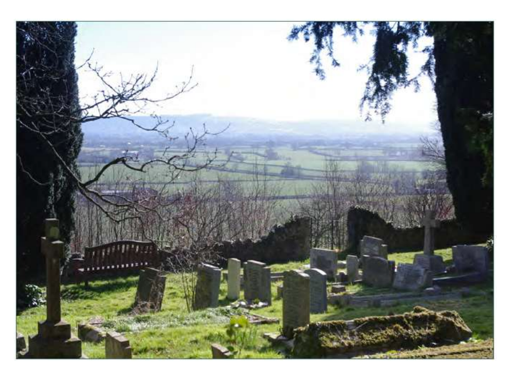
View 13 – View towards Salisbury Plain from Seend Churchyard Grid ref: ST944608

Expansive views across the valley towards Salisbury Plain from within the Holy Cross Churchyard. A church has been present on this site since the 14<sup>th</sup> Century. Further information about the church can be found in the Seend Parish Character Statement. The character of this view is pastoral, and offers a quiet spot for people to sit and reflect.