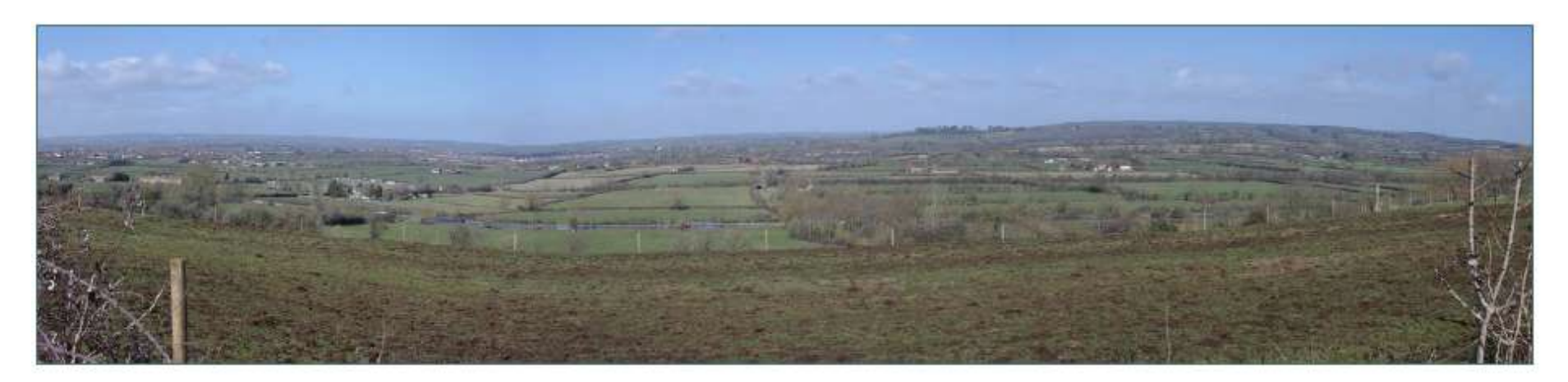
View 5 – Panoramic view looking north across the canal and wider vale from the bridleway (SEEN6) set on the ridgeline north of the Seend Community Centre Grid ref: ST943613

Views are expansive over the predominantly agricultural landscape, interspersed with individual dwellings and farmsteads. This view is representative of views to the north of the Village from the ridge top.