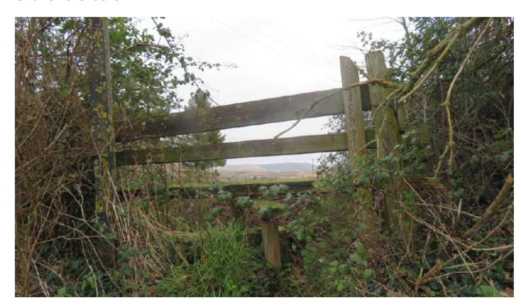
View 8 – Expansive views across the valley towards Roundway Hill from the start of footpath (SEEN2) Grid ref: ST949613

View across the valley towards Roundway Hill, taken through a stile on Spout Lane.