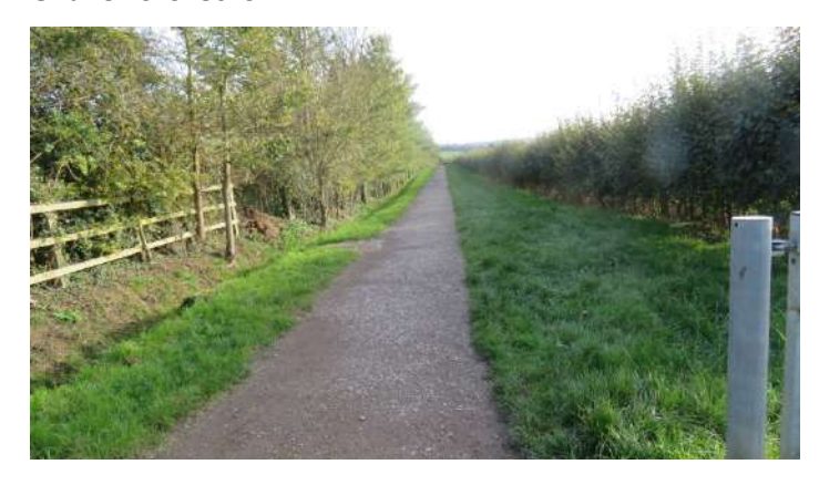
View 20 – View of bridleway (SEEN13) to BRAG picnic area Grid ref: ST918615

View from the entrance of Bowerhill Lane to the BRAG picnic area (adjacent to the canal) taken from the Parish boundary.