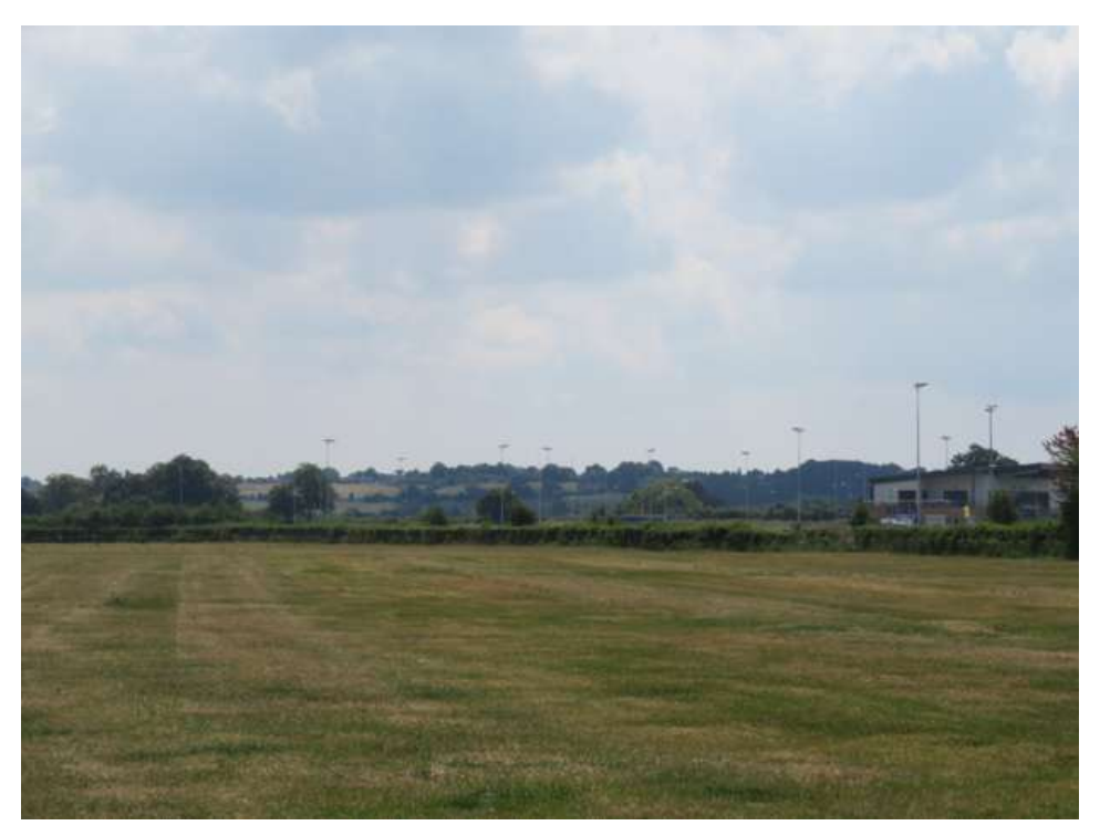
View 35 – Seend Village and Seend Cleeve from Melksham Rugby Club Grid ref: ST920632

Taken from Melksham Rugby Club looking SE towards Seend Cleeve & Seend Village