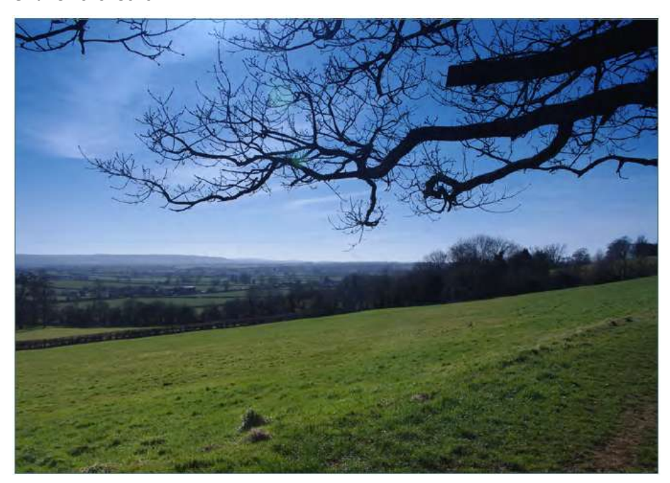
View 11 – View towards Salisbury Plain from the footpath (SEEN7) at south of Seend Village 1 Grid ref: ST948610

Expansive views across the valley towards Salisbury Plain occur from the footpath on the southern edge of the Village. The character of this view is predominantly pastoral.