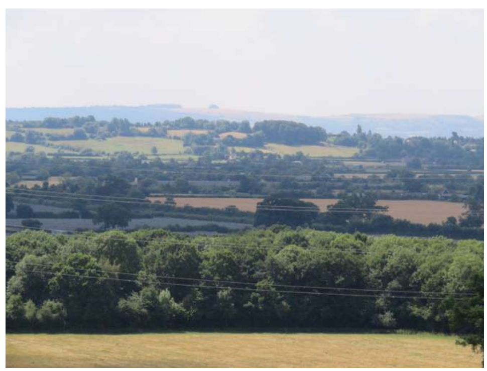
View 30 – Seend Village and Seend Cleeve from the Sandridge Road Grid ref: ST 938647

From a gateway on the A3102 (the Sandridge Road), looking south towards the North ridge of Seend Village and Seend Cleeve.