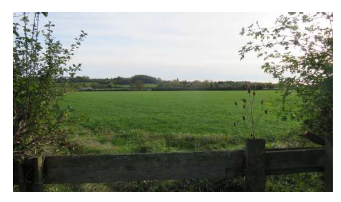
View 16 – Seend Parish from the north approach (looking from the north end of footpath SEEN21) Grid Ref: ST934622

View from Redstocks bus stop looking to the circular clump of beech trees, often referred to as Fairy Wood, shown on the ridgeline, situated in a field below the top of The Pelch.