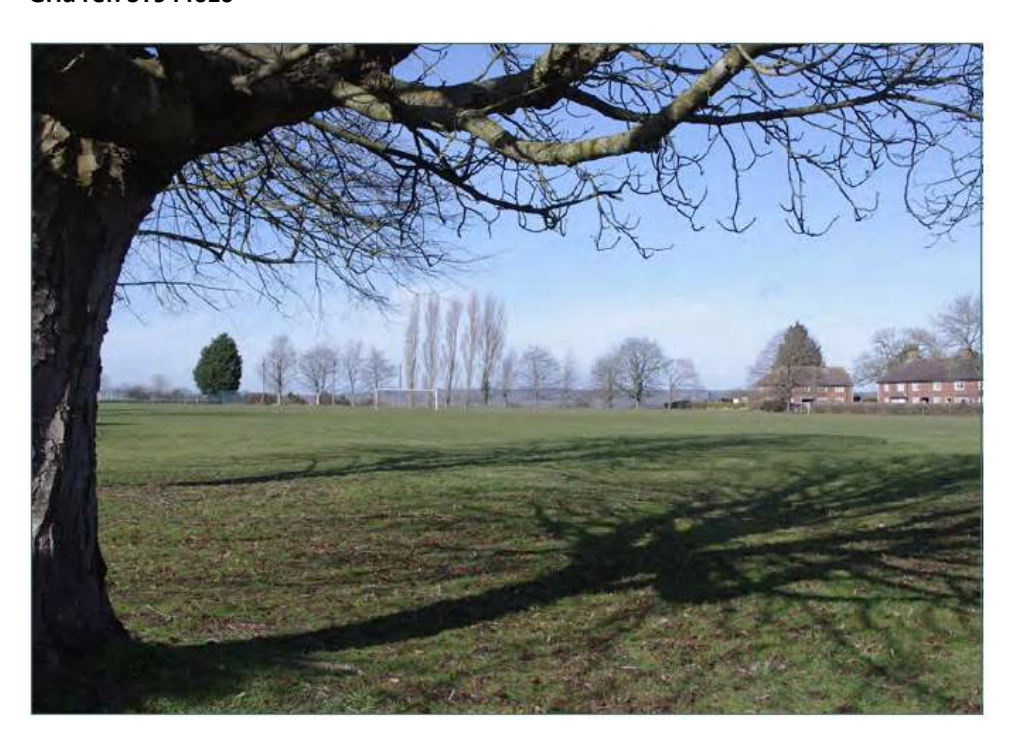
View 15 – View across the Lye Field Grid ref: ST944610

View looking north across the Lye Field from the pavement on the High Street. The line of trees, adjacent to the tennis courts, on the northern edge of the field, in particular the poplars form a characteristic edge to the field allowing views to the wider landscape beyond.