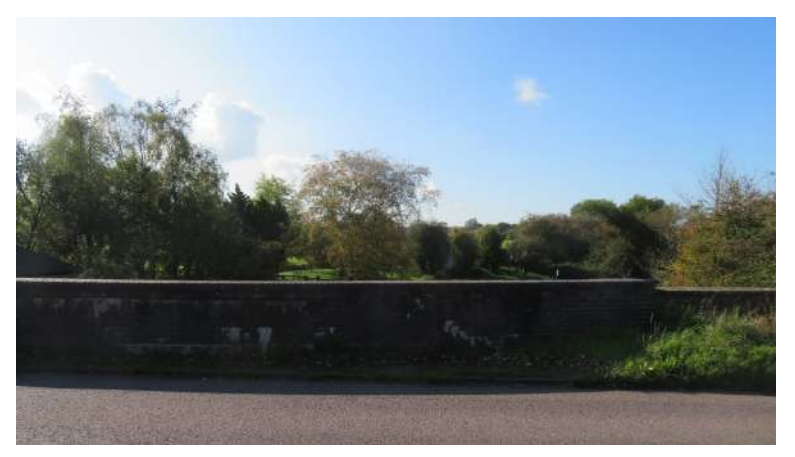
View 27 - Seend ridge from Martinslade Grid ref: ST956618

View from the bridge at Martinslade looking south west.