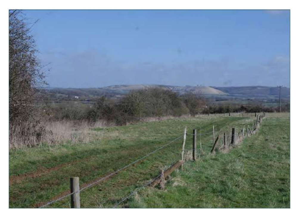
View 6 – View north-east / east towards Roundway Hill Grid ref: ST944613

View looking north-east / east towards the historic Oliver's Castle fort and local landmark of Roundway Hill from the footpath (SEEN6) north of the Lye Field. The character of this view is predominantly pastoral.