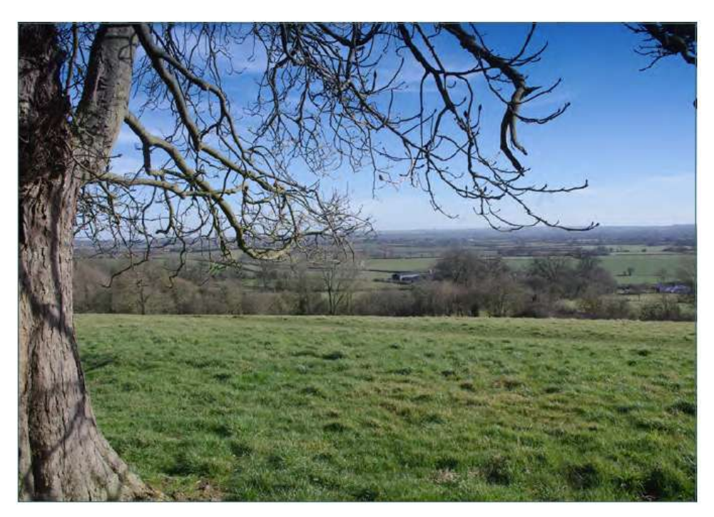
View 12 - View towards Salisbury Plain from the footpath (SEEN7) at the south of Seend Village 2 Grid ref: ST945609

Expansive views across the valley towards Salisbury Plain continue from the footpath on the southern edge of the Village. The character of this view is pastoral with no detracting features.