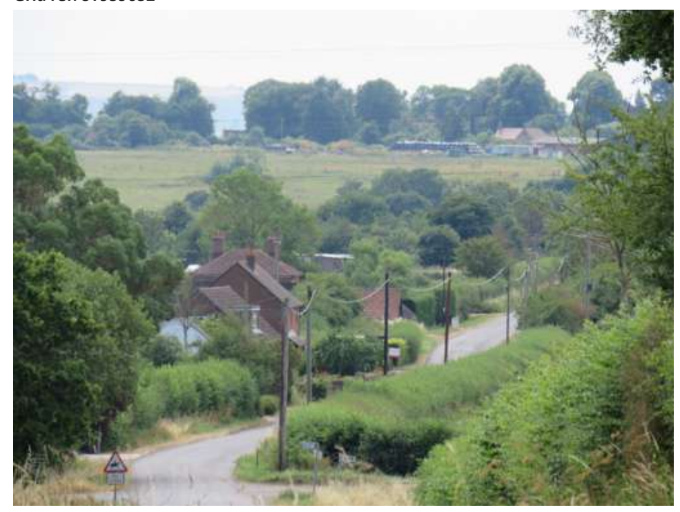
View 29 – View of Sells Green from Bromham Grid ref: ST959632

Sells Green from Bromham. The view coming down the hill from Bromham towards Sells Green.