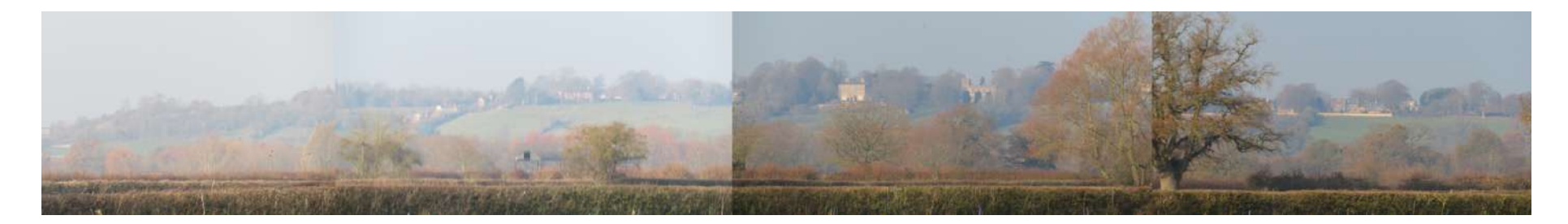
View 32 – Seend Village from the Poulshot Junction on the C20 Grid ref: ST 959583

This is a photo montage of 3 photos to show the panoramic view.