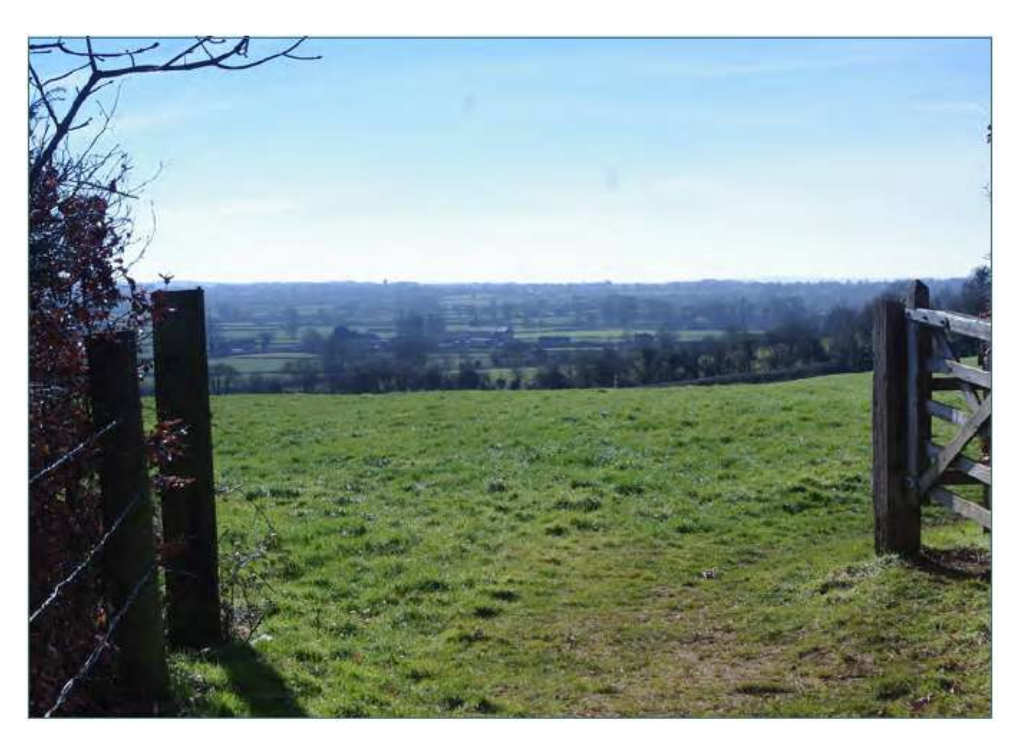
View 10 – View towards Steeple Ashton Church tower Grid ref: ST949610

View looking south-west towards Salisbury Plain from footpath (SEEN7) on the southern edge of Seend Village. A vista towards Steeple Ashton Church tower is afforded between Broomhayes and Seend Park.