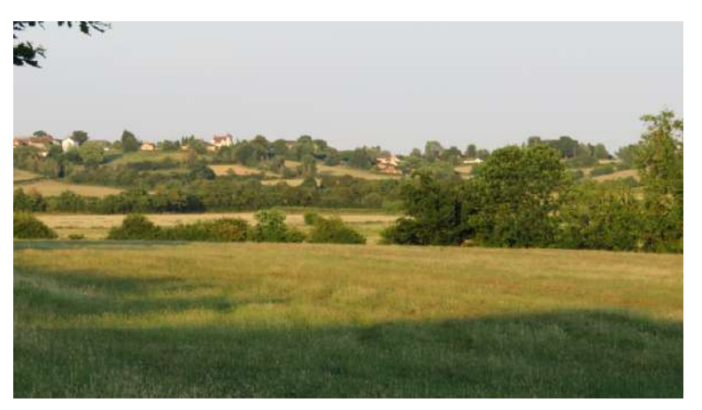
View 22 – Seend Cleeve from K&A swing bridge near Giles Wood Grid ref: ST916609

View of Seend Cleeve from the K & A canal towpath at the swing bridge by Giles Wood looking east.