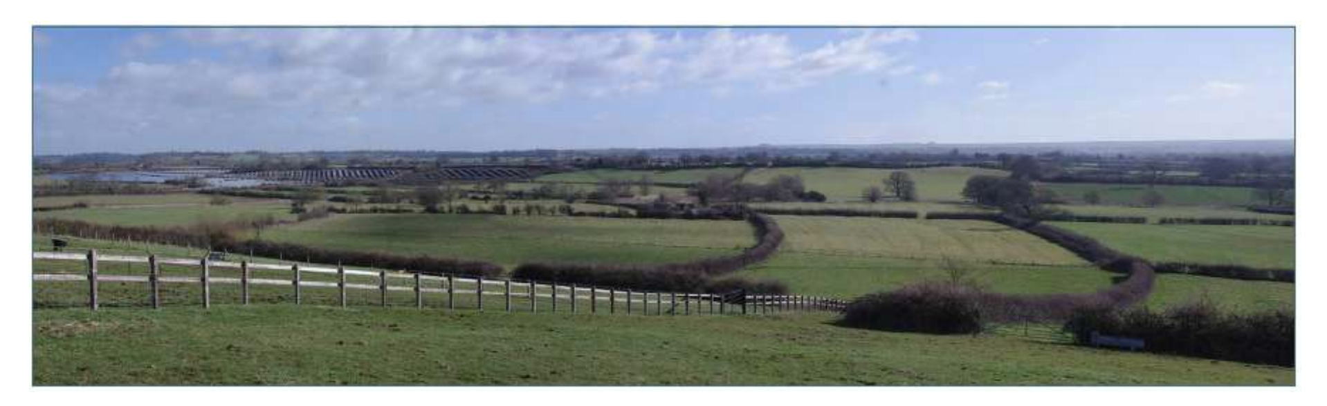
View 9 - View looking south-west from the footpath (SEEN1) adjacent to Loiterton Farm Grid ref: ST953609

Expansive views over the vale towards Salisbury Plain appear from this point. The character of the view is predominantly pastoral; the solar farm is a recent addition within this otherwise green view. The footpath, from which this view can be seen, is significant as the only footpath link between Seend Parish and Poulshot Parish.