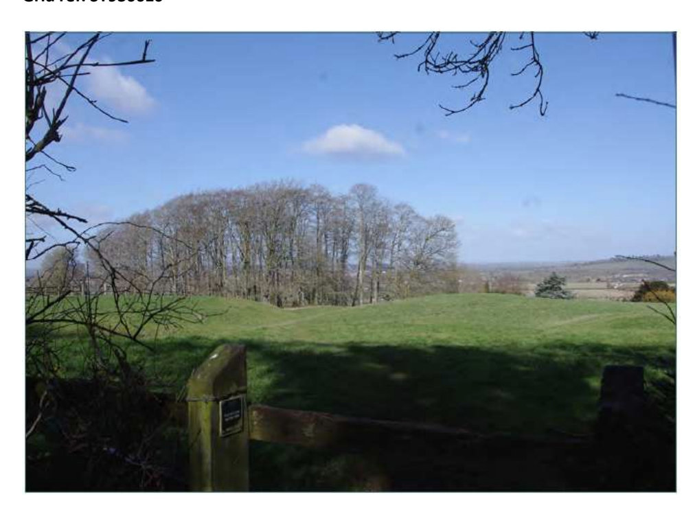
View 4 - View looking north-west from the footpath (SEEN30) adjacent to Pelch Lane and Bollands Hill junction Grid ref: ST936610

The group of beech trees, often referred to as Fairy Wood, form a significant feature in views of the local landscape. The character of this view is predominantly pastoral. The land dips slightly in front of the beech trees — this is part of the historic railway line to the former ironworks. Further information about the Iron Ore works can be found in the HER and in the Locally Valued Heritage Assets Report (P.3).