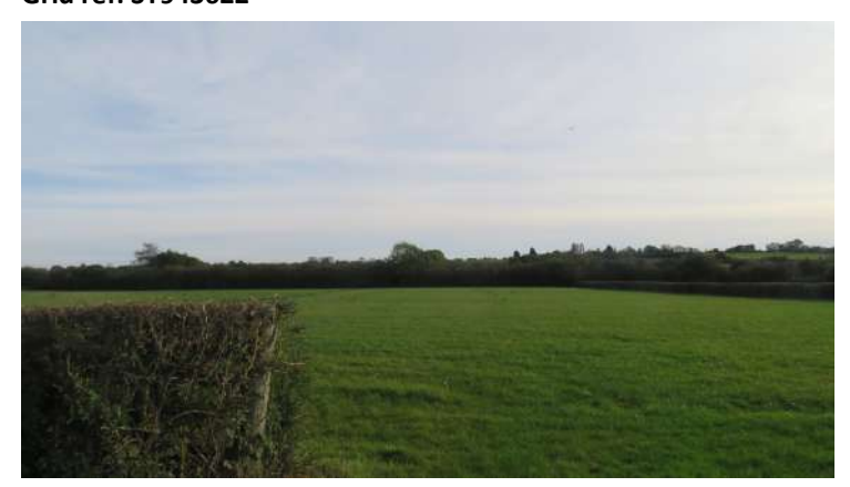
View 17 – Seend ridge from Totterdown Grid ref: ST943622

View from the footpath (SEEN24) on Bath Road by Totterdown Farm looking up to the ridge. This shows open farmland before the ridge.