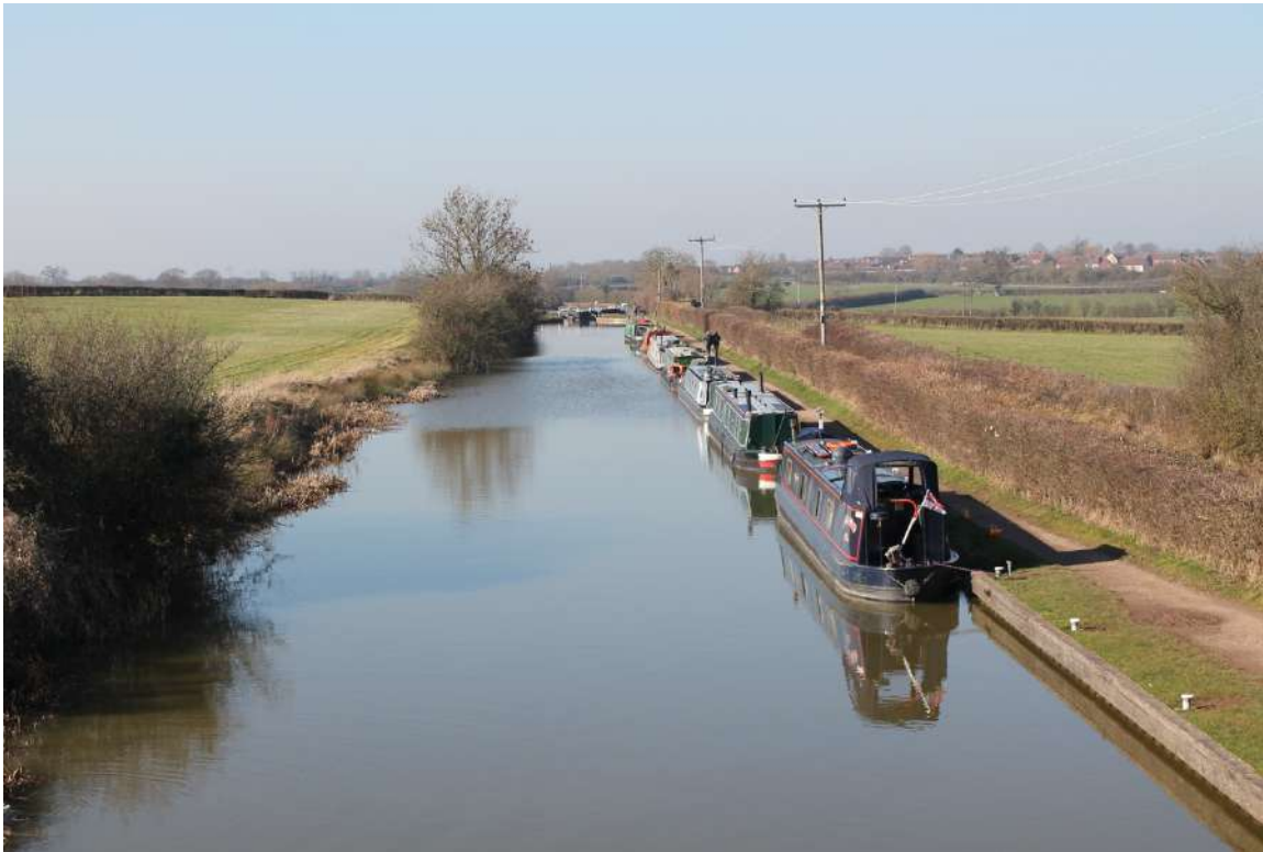
Left: The Kennet & Avon Canal

The Kennet & Avon canal passes through the northern part of Seend Parish for approximately 5km and is a picturesque feature attracting tourist barges and many visitors. The towpath is used extensively by walkers, hikers, dog walkers and cyclists from within the Parish and visitors from elsewhere. The tranquillity of the canal setting encourages people to admire the views and to take photos. Old stone bridges and other features along the canal (identified in the Character Statement and Locally Valued Heritage Assets report), provide feature points to stop and admire the views from and along the canal itself.