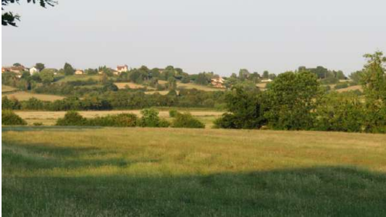
View 22 – Seend Cleeve from K&A swing bridge near Giles Wood Grid ref: ST916609