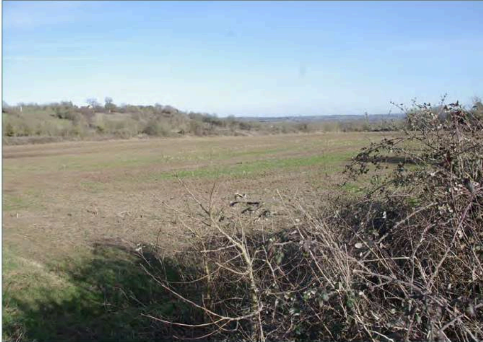
View 3 - View looking south-east from the footpath (SEEN12) south of Seend Cleeve towards Salisbury Plain Grid ref: ST933607

The steep slopes in the mid distance form part of the landscape gap between Seend Cleeve and the cluster of properties south of Pelch Lane between Seend and Seend Cleeve. The character of this view is exclusively pastoral.