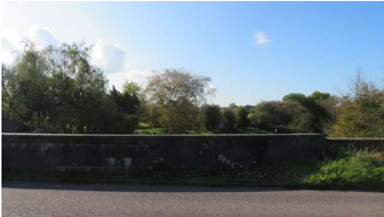
View 27 - Seend ridge from Martinslade Grid ref: ST956618

View from the bridge at Martinslade looking south west.