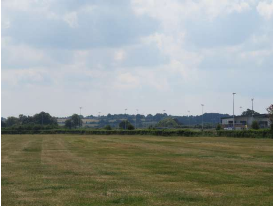
View 35 – Seend Village and Seend Cleeve from Melksham Rugby Club Grid ref: ST920632