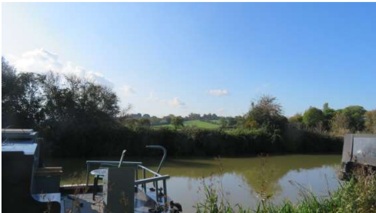
View 28 – Seend ridge from near Parish Boundary at Martinslade Grid ref: ST958617

View of Seend ridge from the eastern end of our canal section between Martinslade & Foxhangers. Photo taken just inside the Parish boundary.