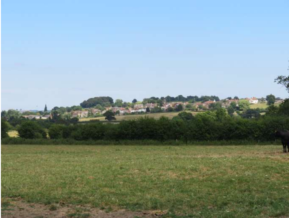
View 36 – Row Lane from the south Grid ref: ST918605

View from the corner of the lane to Seend Park Farm on the junction with Bridleway SEMI30 and footpath SEMI36, looking south east towards the north east ridge of Row Lane.