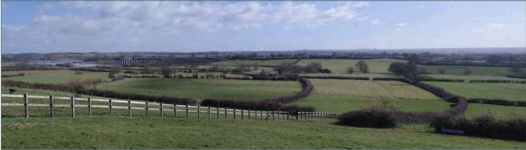
View 9 - View looking south-west from the footpath (SEEN1) adjacent to Loiterton Farm Grid ref: ST953609

Expansive views over the vale towards Salisbury Plain appear from this point. The character of the view is predominantly pastoral; the solar farm is a recent addition within this otherwise green view. The footpath, from which this view can be seen, is significant as the only footpath link between Seend Parish and Poulshot Parish.