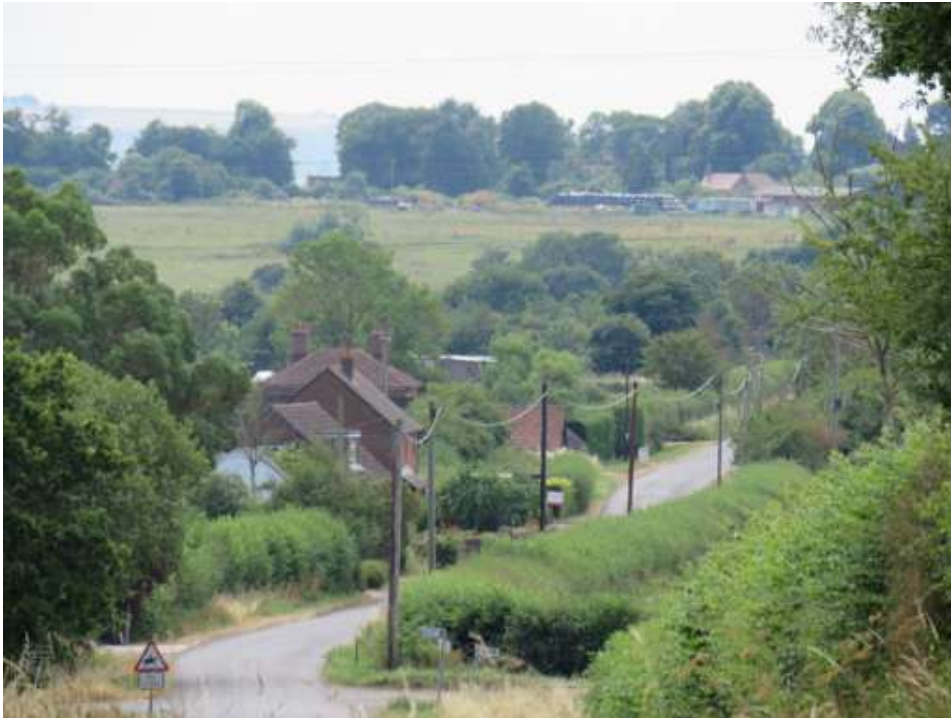
View 29 – View of Sells Green from Bromham Grid ref: ST959632

Sells Green from Bromham. The view coming down the hill from Bromham towards Sells Green.