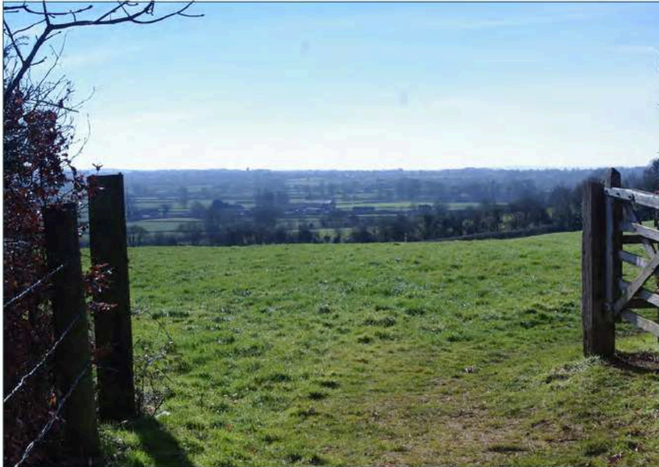
View 10 – View towards Steeple Ashton Church tower Grid ref: ST949610

View looking south-west towards Salisbury Plain from footpath (SEEN7) on the southern edge of Seend Village. A vista towards Steeple Ashton Church tower is afforded between Broomhayes and Seend Park.