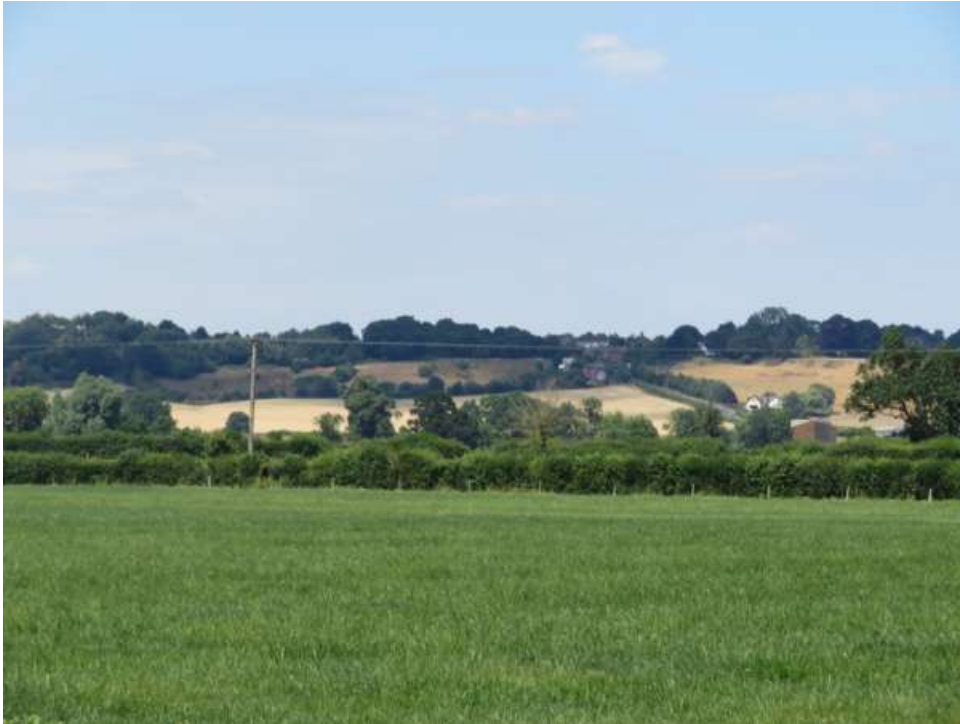
View 33 – South of Seend ridge at the C20 turn off to Bulkington Grid ref: ST949592

At junction of C20 turn off to Bulkington.