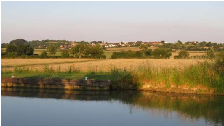
View 23 – Seend Cleeve from K&A swing bridge near BRAG picnic area Grid ref: ST922612