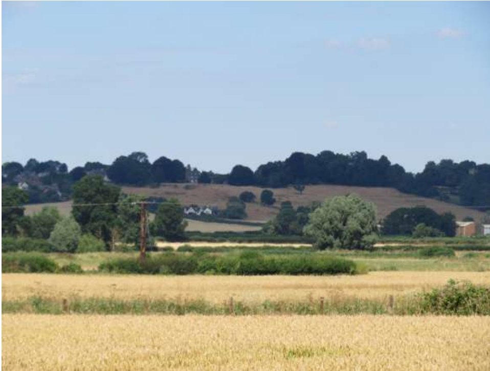
View 34 – Seend ridge from Pantry Bridge Grid ref: ST937587