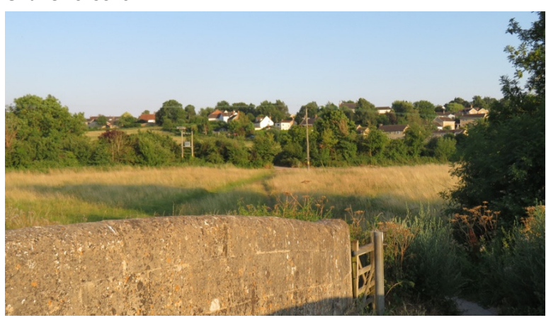
View 24 – Seend Cleeve from near the Barge Inn Grid ref: ST931614

View of Seend Cleeve from the K & A Canal on the stone bridge along footpath(SEEN52) by The Barge Inn looking south.