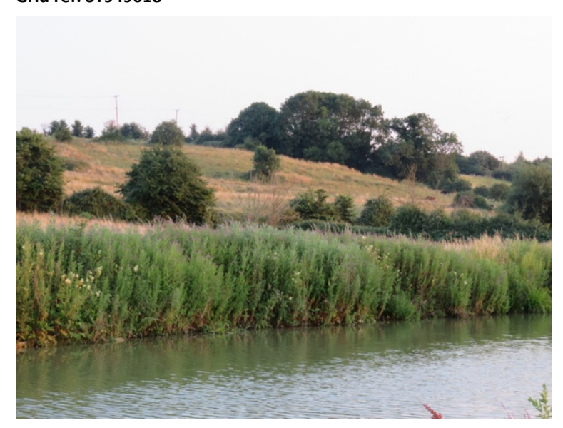
View 26 – Seend ridge from K&A canal towpath in Sells Green Grid ref: ST949618

View from the moorings just to the west of Spout Lane bridge looking to the North ridge of Seend Village. Again the land slopes steeply upwards from the canal side.