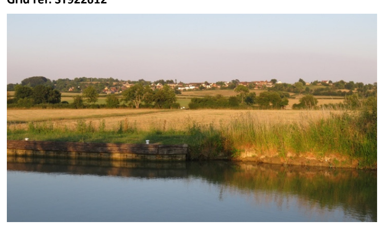
View 23 – Seend Cleeve from K&A swing bridge near BRAG picnic area Grid ref: ST922612

View of Seend Cleeve from the canal towpath on the south side of the swing bridge by the BRAG picnic area and bridleway SEEN13looking south east.