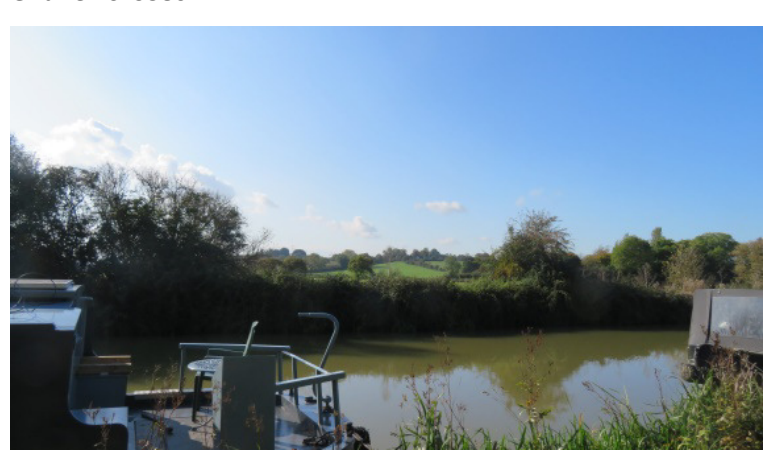
View 28 – Seend ridge from near Parish Boundary at Martinslade Grid ref: ST958617

View of Seend ridge from the eastern end of our canal section between Martinslade&Foxhangers. Photo taken just inside the Parish boundary.