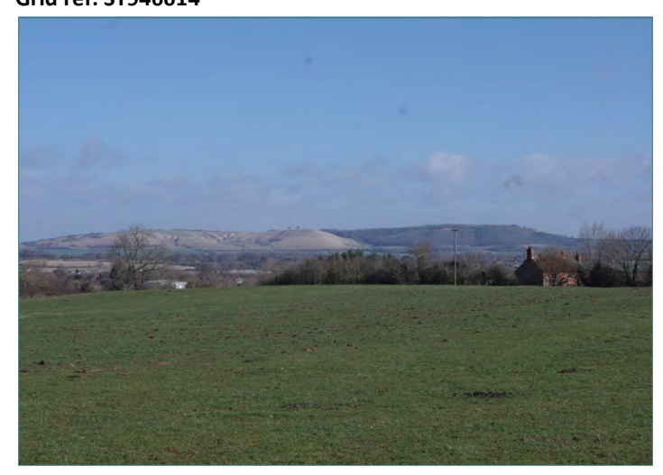
View 7— Expansive view towards Roundway Hill Grid ref: ST946614