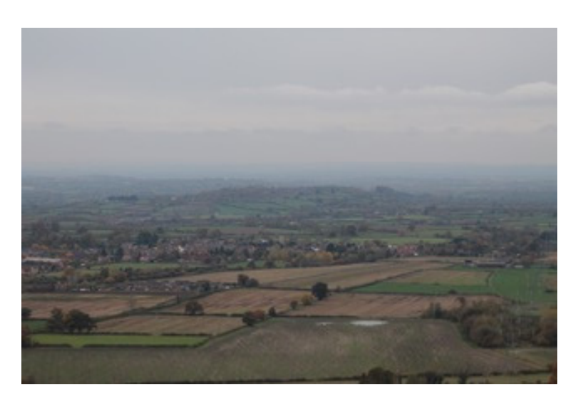
View 31 – Seend Parish fromRoundwayHill Grid ref: SU004638

Taken from RoundwayHill at the edge of the woodland looking west / southwest. You can see Seend Fork junction and Rowde in the middle distance. Salisbury Plain can be seen in the far distance beyond the ridge of Seend Village.