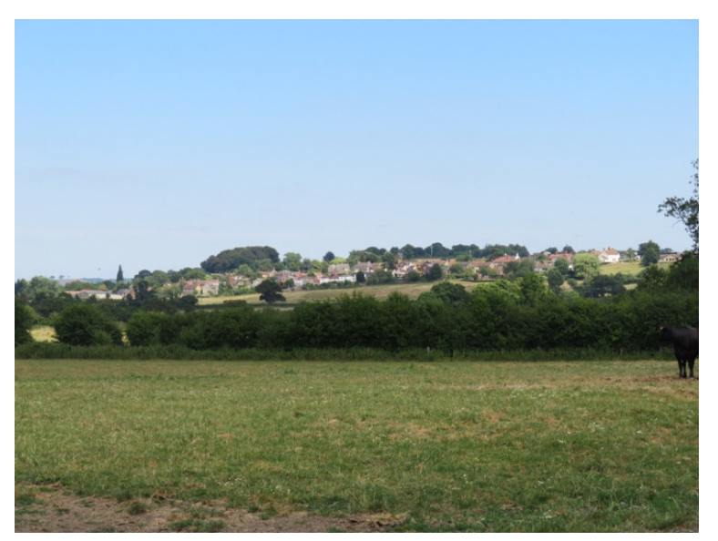
View 36 – Row Lane from the south Grid ref: ST918605

View from the corner of the lane to Seend Park Farm on the junction with Bridleway SEMI30 and footpath SEMI36, looking south east towards the north east ridge of Row Lane.