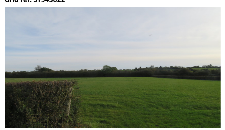
View 17 – Seendridge from Totterdown Grid ref: ST943622

View from the footpath(SEEN24) on Bath Road by Totterdown Farm looking up to the ridge. This shows open farmland before the ridge.