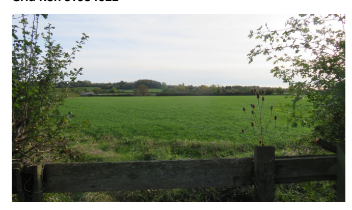
View 16-Seend Parish from the north approach(looking from the north end of footpathSEEN21) Grid Ref: ST934622

View from Redstocks bus stop looking to the circular clump of beech trees, often referred to as Fairy Wood, shown on the ridgeline, situated in a field below the top of The Pelch.