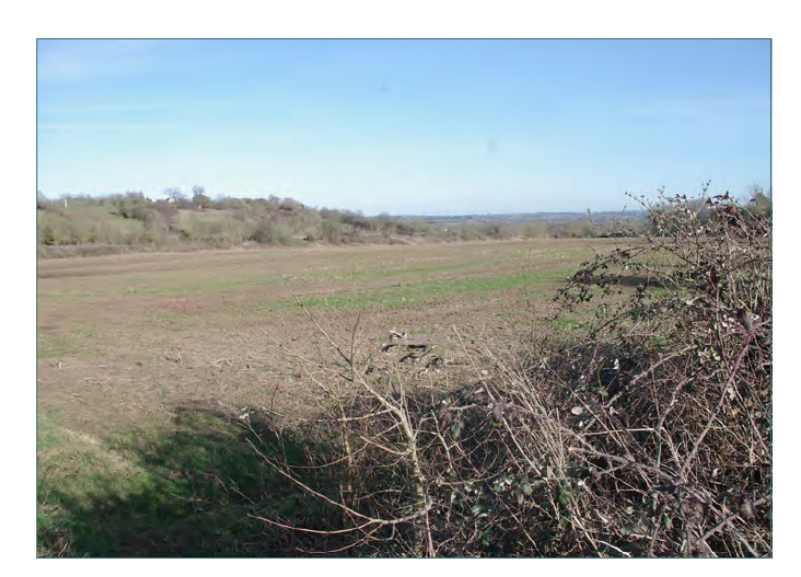
View 3 - View looking south-east from the footpath(SEEN12) south of Seend Cleeve towards Salisbury Plain Grid ref: ST933607

The steep slopes in themid distance formpart of the landscape gap between Seend Cleeve and the cluster ofproperties south of Pelch Lane between Seend and Seend Cleeve. The character of this view is exclusively pastoral.