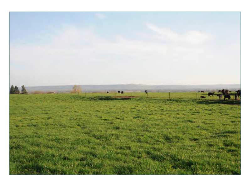
View 2— View towards Salisbury Plain from Seend Cleeve Grid ref: ST932608

View looking south from footpath(SEEN23) south of Seend Cleeve towardsSalisbury Plain. Representative of views towards Salisbury Plain from the south of settlements in the Parish.