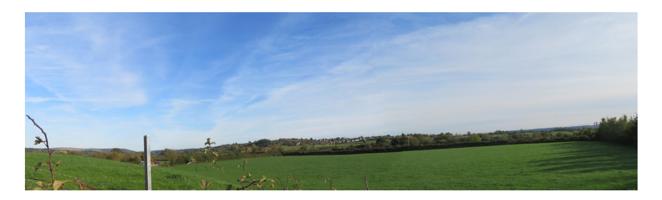
Map 1 reference Key ViewO: For high quality and distinctive 'visual amenity'

Just a few meters to the east of View 20on Bowerhill Lane, there are extensive views looking SE towards Seend Cleeve. The trees in mid-frame run along both sides of the Kennet & Avon Canal. The Kennet & Avon Canal is an important recreational facility and wildlife corridor. More information is available in the Green Infrastructure Report.