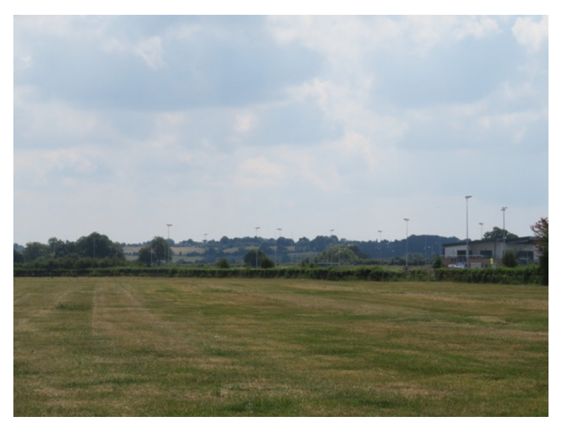
View 35 – Seend Village and Seend Cleeve from Melksham Rugby Club Grid ref: ST920632

Taken from Melksham Rugby Club looking SE towards Seend Cleeve & Seend Village