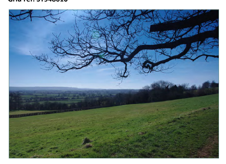
View 11 – View towards Salisbury Plain from the footpath(SEEN7) at south of Seend Village1 Grid ref: ST948610

Expansive views across the valley towards Salisbury Plain occur fromthe footpath on the southern edge of the Village. The character of thisview is predominantly pastoral.