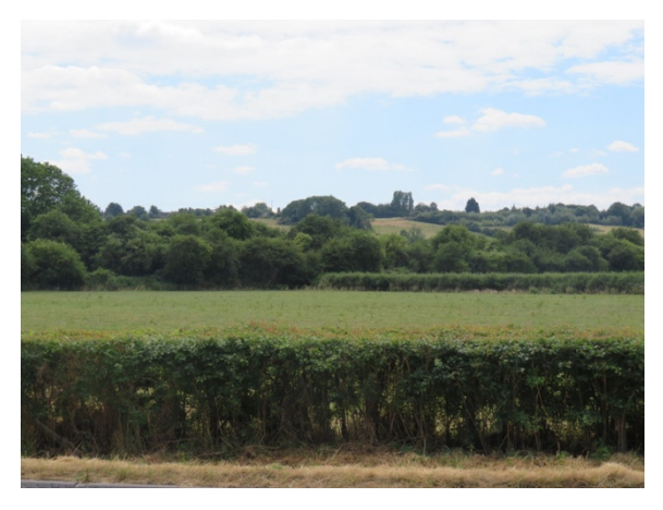
View 18 – Seend ridge from A365 junction with Broad Lane Corner Grid ref: ST948624

View from the A365 junction with Broad Lane Corner, looking S/W towards the North ridge of Seend. The photo is taken from the junction at Broad Lane corner. This is the meeting point of several bridleways which are usedby residents and businesses who live and work along Broad Lane.