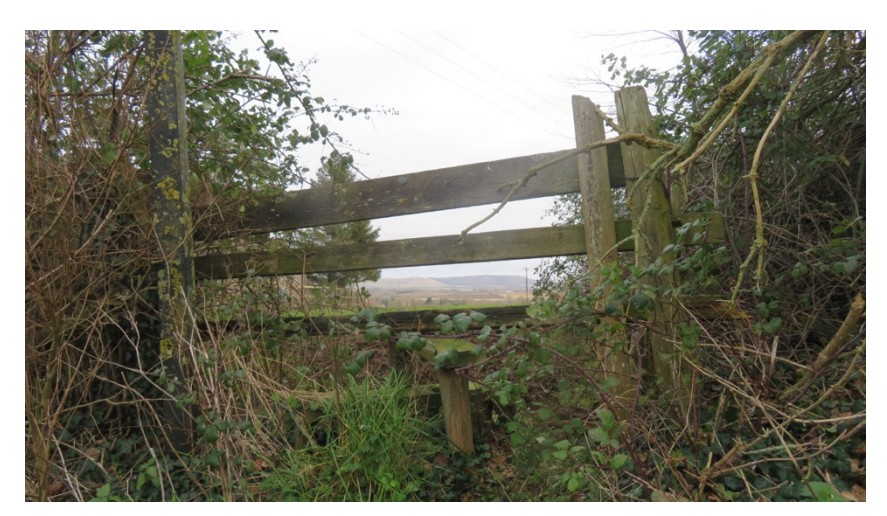
View 8 – Expansive views across the valley towards Roundway Hill from the start of footpath(SEEN2) Grid ref: ST949613

View across the valley towards Roundway Hill, taken through a stile on Spout Lane.