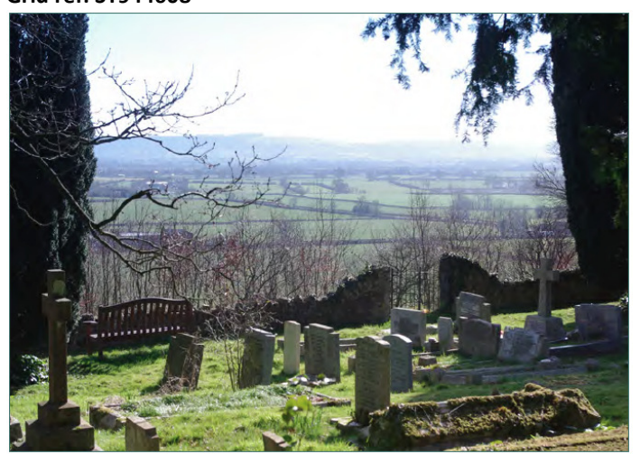
View 13 – View towards Salisbury Plain from Seend Churchyard Grid ref: ST944608

Expansive views across the valley towards Salisbury Plain fromwithin the Holy CrossChurchyard. A church has been present on this site since the 14<sup>th</sup>Century.Further information about the church can be found in the SeendParish Character Statement.The character of this view ispastoral, and offers a quiet spot for people to sit and reflect.