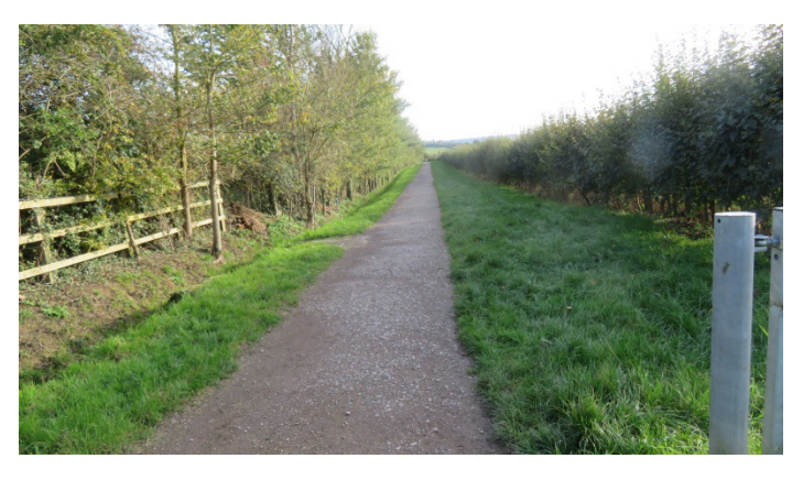
View 20 –View of bridleway(SEEN13)to BRAG picnic area Grid ref:ST918615

View from the entrance of Bowerhill Lane to the BRAG picnic area(adjacent to the canal)taken from the Parish boundary.