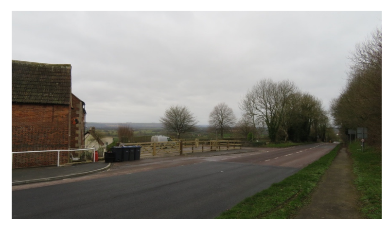
View 14 – View towards Salisbury Plain from Bell Hill Grid ref:ST940608

View looking south west from the A361 and C20 crossroad at the western gateway to the Village. The view looks across the old pub carpark of The Bell Inn(now a private residence) towards Salisbury Plain, which is visible in the distance.