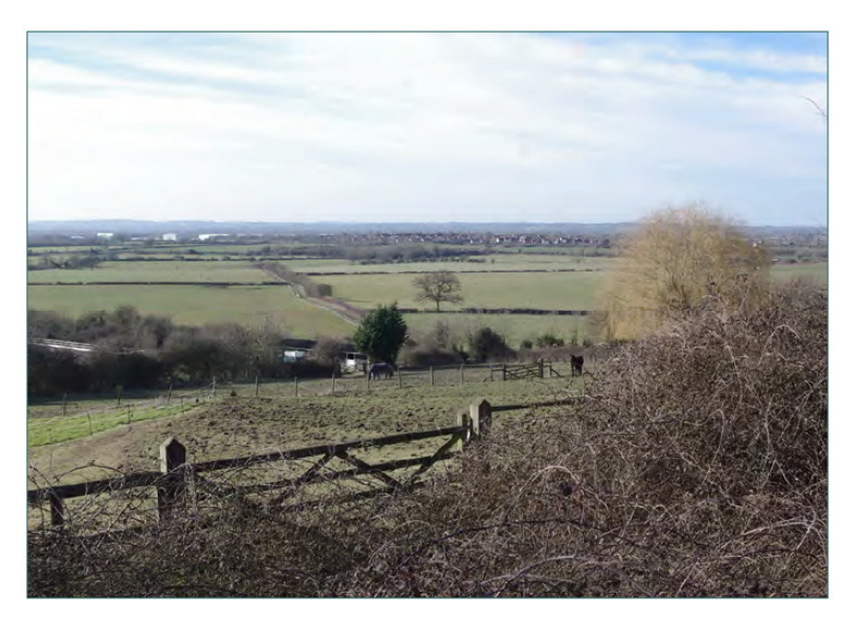
View 1- View looking north-west towards the Kennet& Avon Canal and Melksham beyond from The Stocks lane. Taken from footpath (SEEN38) Grid ref: ST929606

The key characteristics ofthis view are the sloping fields with boundaries marked by vegetation, containing individual buildings, in contrast to the flat agricultural valley landscape beyond and the settled area of Melksham beyond that. PRoW SEEN13 runs alongside the left of the hedgerow running diagonally in the centre of the frame shown opposite. The PRoWfollows this hedgeline towards the canal swingbridge&Bowerhill. The movement of walkers and horse-riders is often seen in the landscape.