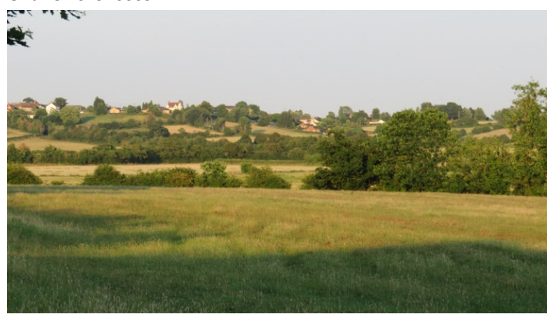
View 22 – Seend Cleeve from K&A swing bridge near Giles Wood Grid ref: ST916609

View of Seend Cleeve from the K & A canal towpath at the swing bridge by Giles Wood looking east.