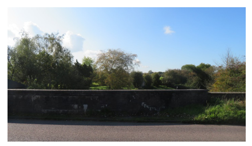
View 27 -Seend ridge from Martinslade Grid ref: ST956618

View from the bridge at Martinslade looking south west.