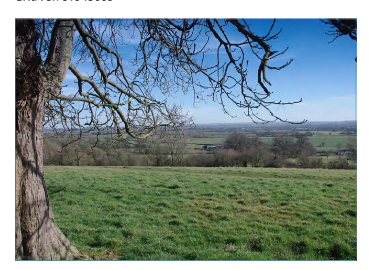
View 12 - View towards Salisbury Plain from the footpath(SEEN7) at the south of Seend Village2 Grid ref: ST945609

Expansive views across the valley towards Salisbury Plain continue from the footpath on the southern edge of the Village. Thecharacter of this view ispastoral with no detractingfeatures.