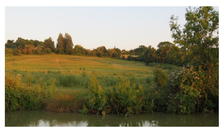
View 25 – Seend ridge from the K&A canal near Lock Cottage Grid ref: ST938615

View towards Seend Village ridge from the K & A Canal by Lock Cottage looking south.