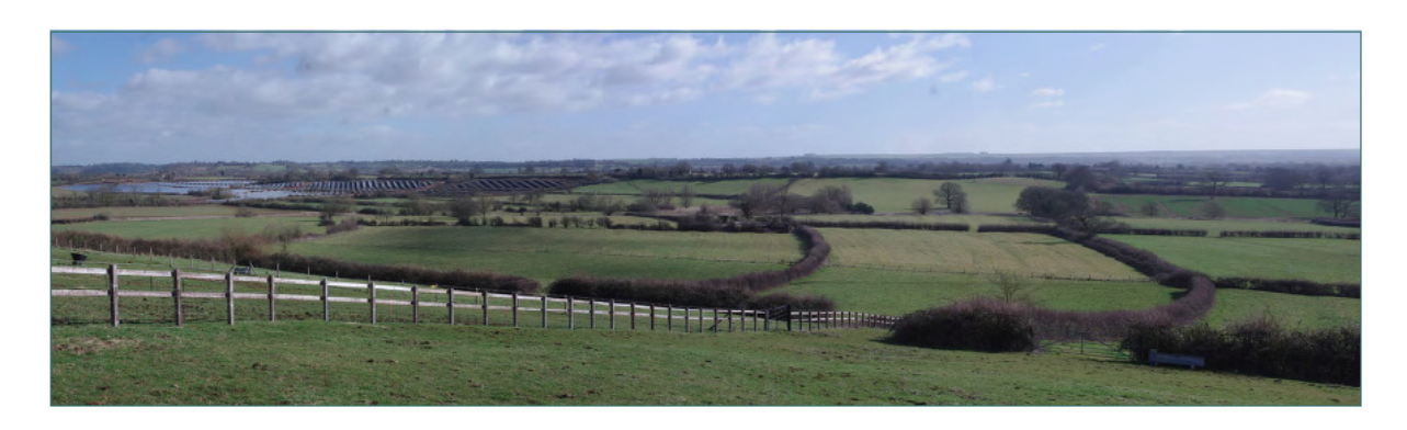
View 9- View looking south-west from the footpath(SEEN1) adjacent to Loiterton Farm Grid ref: ST953609

Expansive views over the vale towards Salisbury Plain appear from this point. The character of the view is predominantly pastoral; the solar farm is a recent addition within this otherwise green view. The footpath, from which this view can be seen, is significant as the only footpath link between Seend Parish and Poulshot Parish.