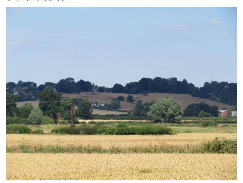
View 34 – Seend ridge from Pantry Bridge Grid ref: ST937587