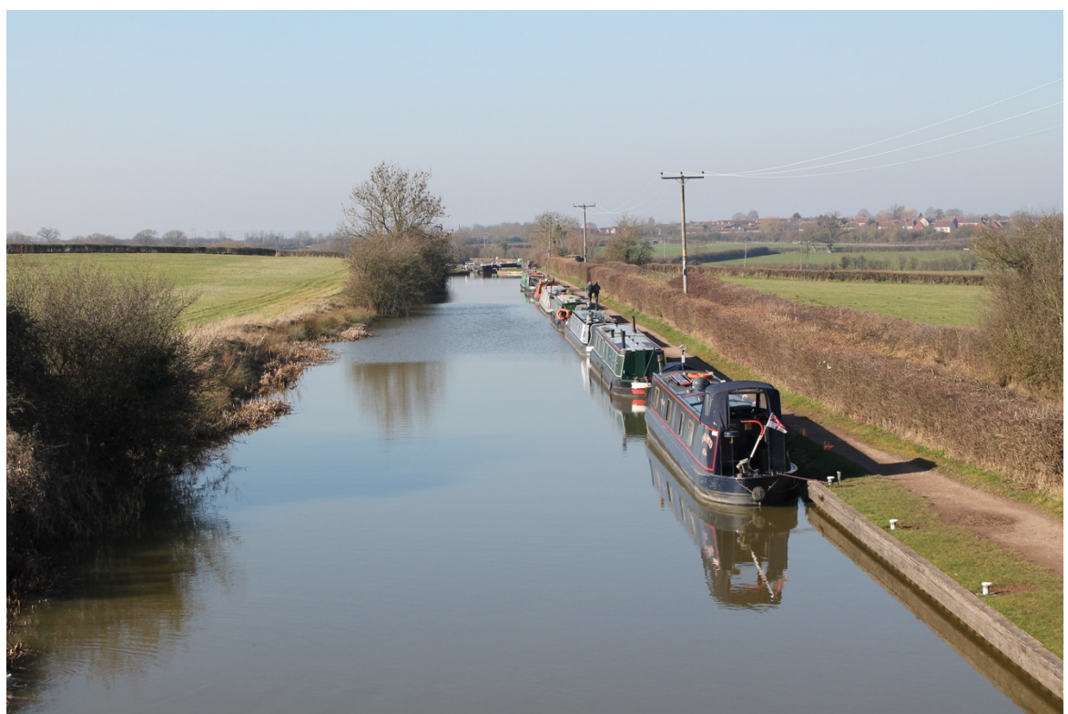
Above: The Kennet & Avon Canal

The Kennet & Avon canal passes through the northern part of Seend Parish for approximately 5km and is a picturesque feature attracting tourist barges and many visitors. The towpath is used extensively by walkers, hikers, dog walkers and cyclists from within the Parish and visitors from elsewhere. The tranquillity of the canal setting encourages people to admire the views and to take photos. Old stone bridges and other features along the canal (identified in the Character Statement and Locally Valued Heritage Assets report), provide feature points to stop and admire the views from andalong the canal itself.