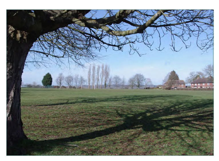
View 15 – View across the Lye Field Grid ref: ST944610

View looking north across the Lye Field from the pavement on the High Street. The line of trees, adjacent to the tennis courts, on the northern edge of the field, inparticular the poplars form a characteristic edge to the field allowing views to the wider landscape beyond.