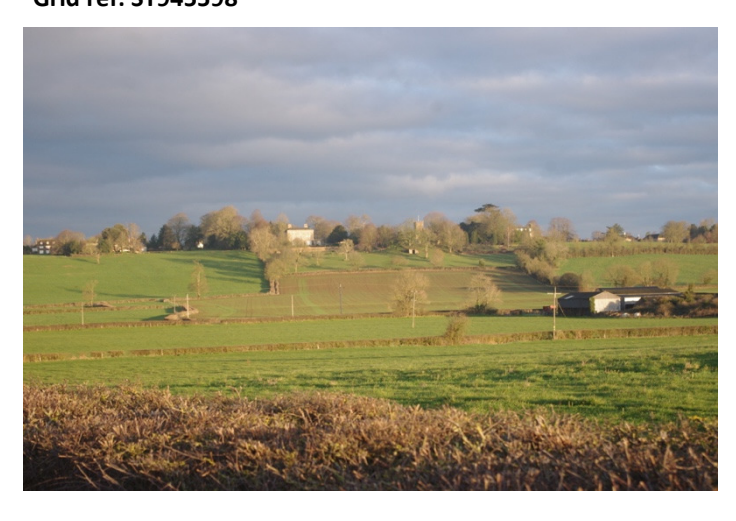
View19 – Seend ridge from the south Grid ref: ST945598

View from the C20 by Seend Bridge House, looking north towards the south ridge of Seend Village.