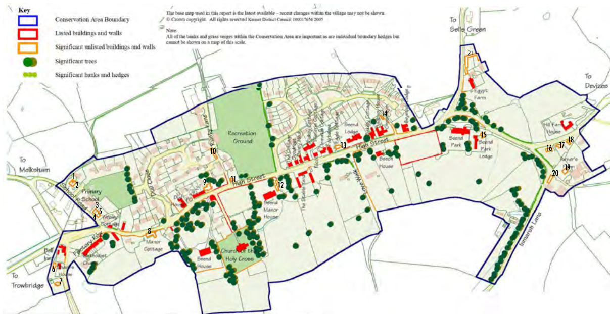
Map 1: Itemised Significant Unlisted Heritage Assets (buildings and walls) as identified in the Conservation Area Statement (2005)

The map is extracted from the Statement, but updated with the Significant Unlisted Heritage Assets being numbered.