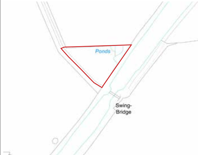
Bowerhill Residents Association Group Picnic Area