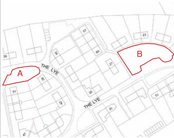
The Lye Green Areas A & B